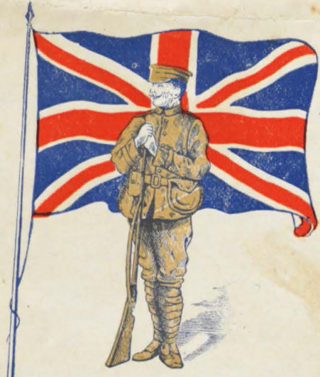
FOR GOD AND HOME AND NATIVE LAND

Dear Mother with reference to you which I received you letter all write and was pleased of getting it from you hoping to hear from you again Dear mother I want be long hear now I am expecting to go any moment now mother so mother I did not